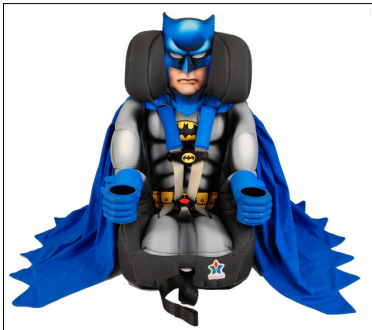
KidsEmbrace Batman Child Restraint

There are a few things to know about this course. Op Kids can be taught by certified CPS Technicians . It is important to review all course materials before scheduling a class because course materials can be tailored to meet the needs of your target audience. By this we mean that information repeated in the sections for Health Care and Law Enforcement might not need to be repeated if you only have Health Care Professionals in your class, or likewise, if you only have Law Enforcement professionals in your class. This is helpful to know as you prepare your course agenda. Actual content of the course should not be altered in any way as it has been reviewed and approved by NHTSA. Furthermore, if there is a certified CPST Instructor involved you are allowed to utilize videos from the CPST certification course to further support the content you are teaching.